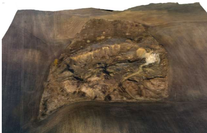
Figure 3. General view and terrain

different ecotones was revealed. A similar trend was identified as a result of studies of other quarry-dump complexes: the authors A. Bonchkovskiy & O. Bezsmertna (2020) indicated that the main influence on the dispersal of species is exerted by factors such as topography and lithological substrate, which determine the heterochrony of succession; a considerable influence of topography on vegetation development is noted by L.K. Savchuk (2020). The general view and terrain of the quarry is presented in Figure 3.