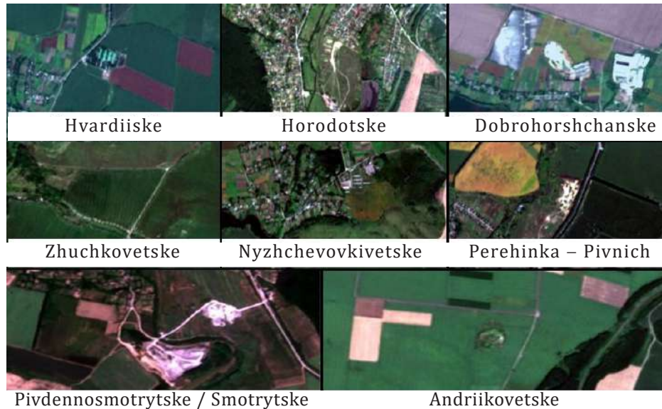
Figure 2. State of mining and industrial landscapes according to satellite images

cover is recorded, which is an essential factor in soil formation: elements and humus compounds accumulate, the water regime changes, and the anthropogenic substrate is transformed into soil. Under favourable conditions, the process of self-growth passes from the initial successive stage of pioneer development by individual foci to the development of complex stable phytocenoses. Satellite data (as of 2021) of the detected devastated areas are presented in Figure 2.